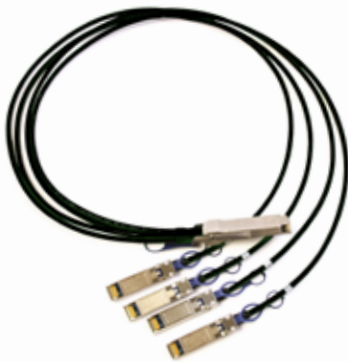
Prequalified QSFP+ to 4xSFP+ cables are included

Any data lane from any device connected to back of the hub can be directed to any device connected to the front of the hub. Lane shuffling is done in a simple feed-through format.